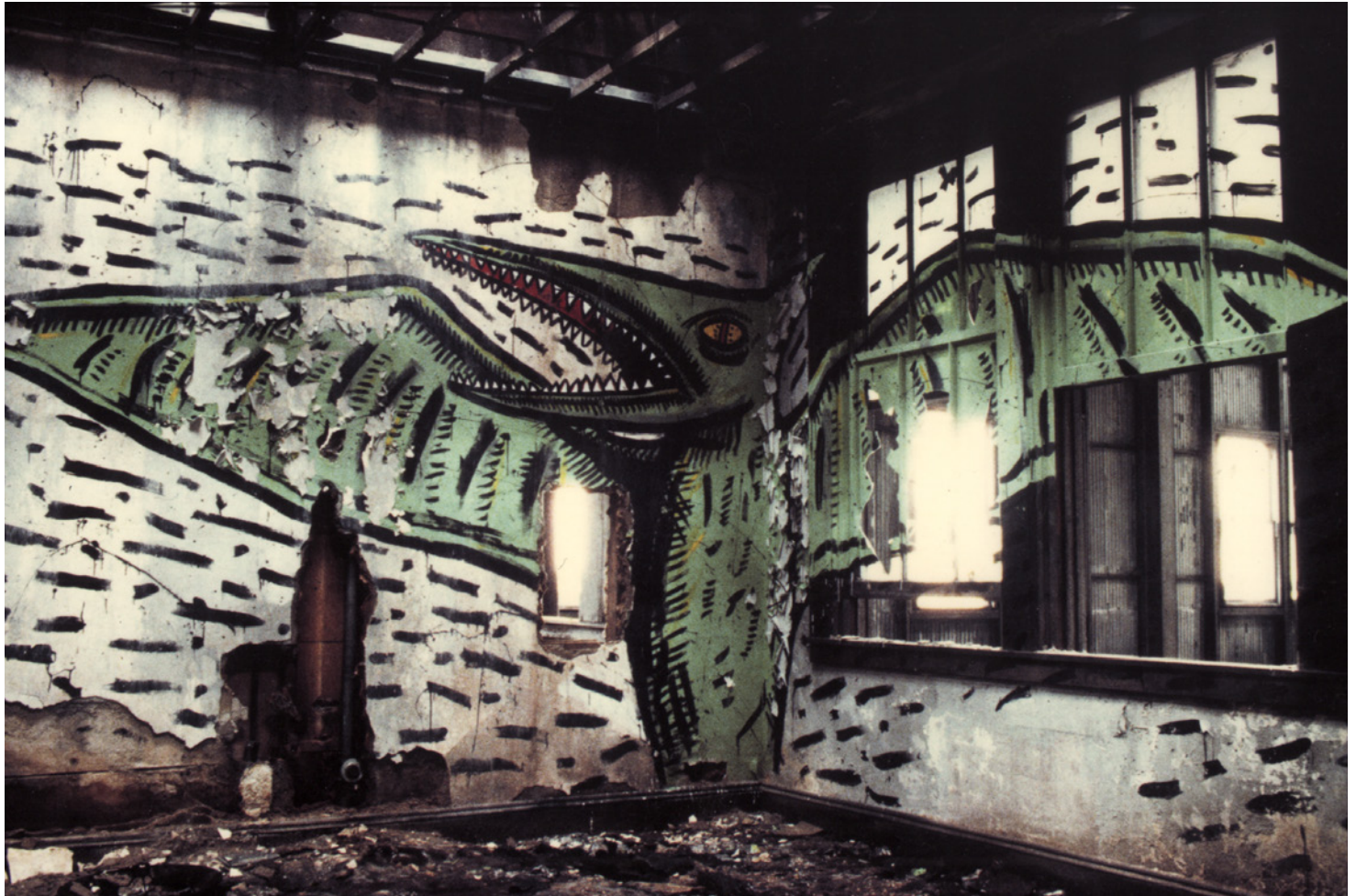
PIER 28 PTERODACTYL (MURAL PAINTING DW)