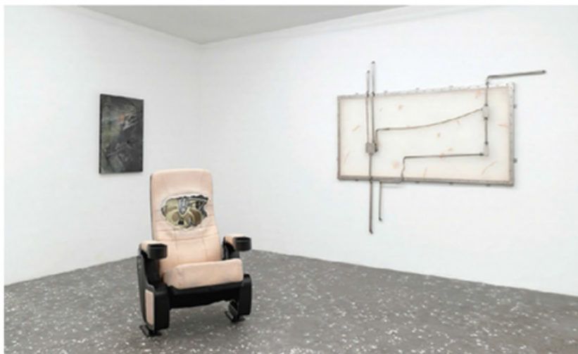
View of “Dora Budor,” 2015. From left: The Host, or You , 2014; Mental Parasite Retreat 1 , 2014; The Architect, Slowly Crawling , 2014.

Creepy as a scene from a sci-fi blockbuster, Dora Budor’s exhibition “The Architect’s Plan, His Contagion and Sensitive Corridors” invaded the gallery with swaths of synthetic skin, severed cyborg prostheses, and images of smoldering, wreckage-filled landscapes. In fact, it’s all “screen-used” stuff you might have seen at the movies. Budor reclaims the materiality of silicone scars, cyborg body parts, and other substances specifically designed for digital capture, manipulation, and consumption. Removed from their original contexts, these artifacts of imaginary worlds appear significantly less convincing than they do at the multiplex, but no less menacing. The threat she describes is neither space invaders nor robot time-travelers, but the disintegrating boundary between the virtual and the actual. In doing so, she reconfigures what feels real in a culture increasingly obsessed with artificial experiences.