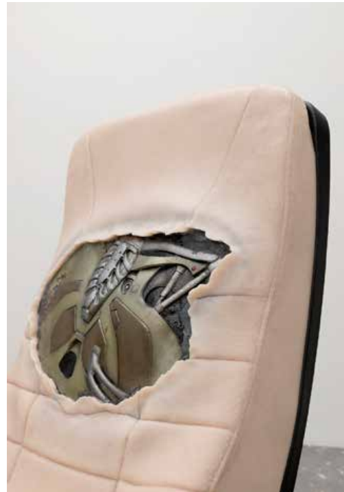
Opposite - Mental Parasite Retreat 1 , 2014.